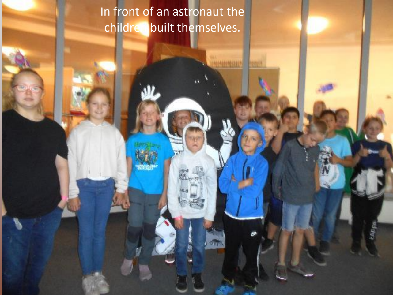
In front of an astronaut the children built themselves.